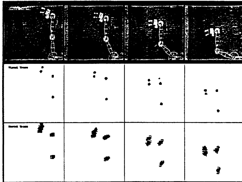
Figure 2: Three Visual Traces. The top trace shows the unprocessed camera view of MURPHY's arm. White spots have been stuck to the arm at various places, such that a thresholded image contains only the white spots. This allows continuous control over the visual complexity of the image. The center trace represents the resulting pattern of activation over the 64 x 64 grid of coarsely-tuned visual units. The bottom trace depicts an internally-produced "mental" image of the arm in the same configuration as driven by weighted connections from the joint population. Note that the "mental" trace is a sloppy, but highly recognizable approximation to the camera-driven trace.

will become progressively and mutually reinforced at the expense of the set of wrist unit connections, each of which was only activated a single time.