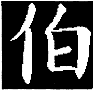
Figure 1.a: Bitmap Of Chinese Character Which Is The Input Image