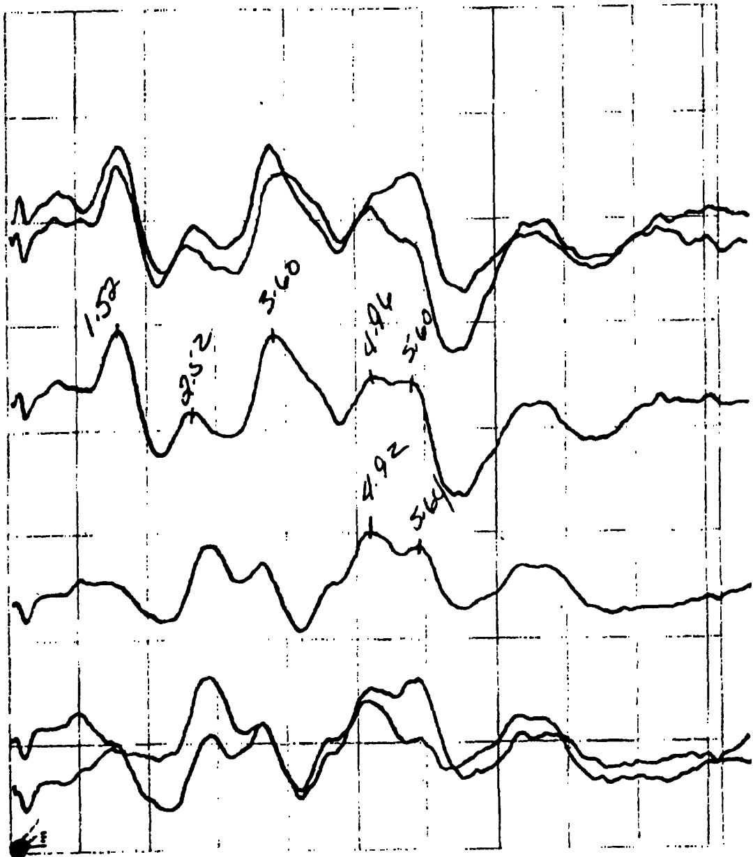
Figure 1. BAEP chart with the time of arrival for waves I to V identified.

process. In these cases we say that wave V is absent. Finally, the latencies and possibly the amplitudes of the identified peaks are measured and a diagnostic explanation for them is developed.