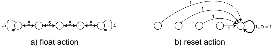
Figure 2: Underlying dynamics of the float/reset problem for a) the float action and b) the reset action. The numbers on the arcs indicate transition probabilities. The observation is always 0 except on the reset action from the rightmost state, which produces an observation of 1.

length history is a sufficient statistic. A POMDP approach can model it exactly by maintaining a belief-state representation over five or so states. A PSR, on the other hand, can exactly model the float/reset system using just two tests: r1 and f0r1 . Starting from the rightmost state, the correct predictions for these two tests are always two successive probabilities in the sequence given above (1, 0.5, 0.5, 0.375, \dots) , which is always a sufficient statistic to predict the next pair in the sequence. Although this informational analysis indicates a solution is possible in principle, it would require a nonlinear updating process for the PSR.