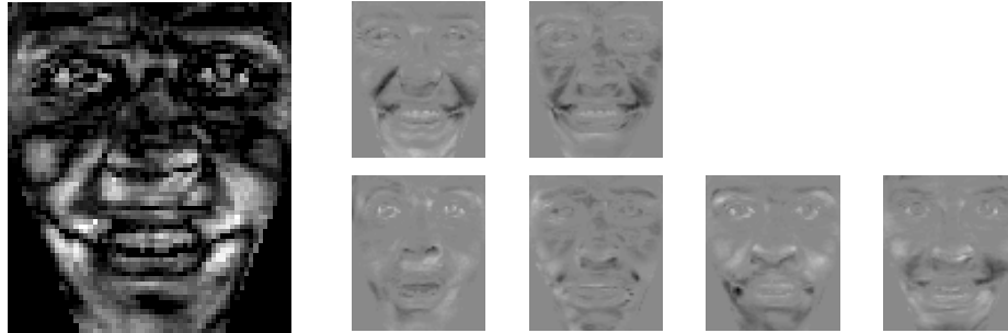
Figure 2: Left: expression mask of happiness provided by the scaling factors \sigma ; Right, top row: the two positive masked support face; Right, bottom row: four negative masked support faces.

Preliminary experimental results show that the method provides sensible results in a reasonable time, even in very high dimensional spaces, as illustrated on a facial expression recognition task. In terms of test recognition rates, our method is comparable with [9, 3]. Further comparisons are still needed to demonstrate the practical merits of each paradigm.