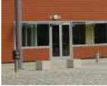
(a) Low-resolution image (1 of 16)