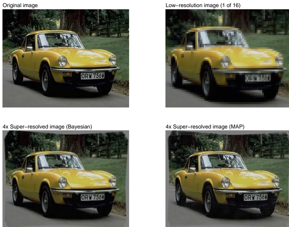
Figure 1: Example using synthetically generated data showing ( top left ) the original image, ( top right ) an example low resolution image and ( bottom left ) the inferred super-resolved image. Also shown, in ( bottom right ), is a comparison super-resolved image obtained by joint optimization with respect to the super-resolved image and the parameters, demonstrating the significantly poorer result.

In Figure 1(a) we show the original image, together with an example low resolution image in Figure 1(b). Figure 1(c) shows the super-resolved image obtained using our Bayesian approach. We see that the super-resolved image is of dramatically better quality than the low resolution images from which it is inferred. The converged value for the PSF width parameter is \gamma = 1.94 , close to the true value 2.0.